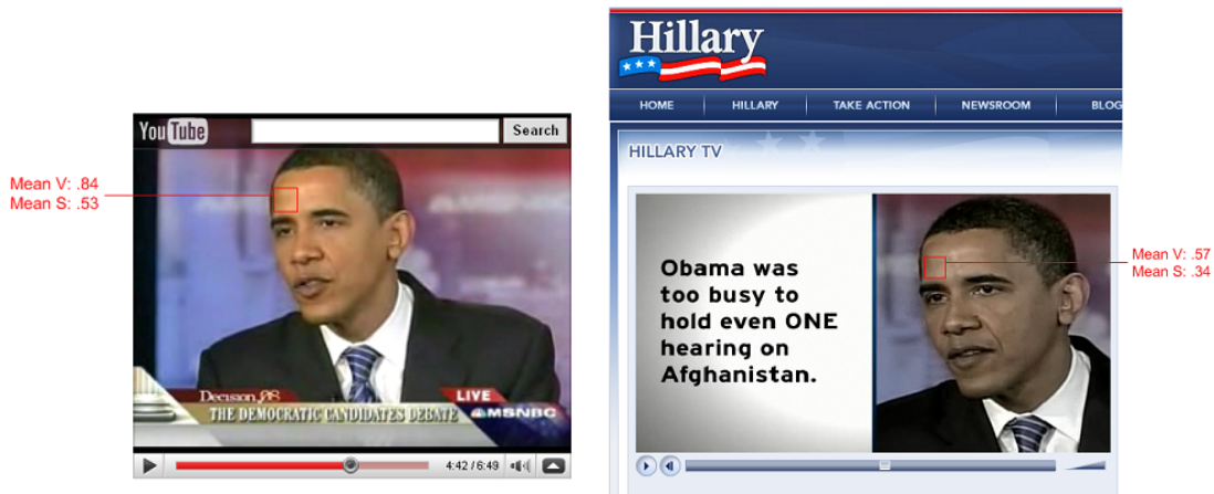
Figure 3: Video still capture from original MSNBC footage (via YouTube) and ad on Clinton campaign website

The images in Figure 3 above show video stills that I captured from the Clinton campaign website and the original MSNBC footage (from YouTube). The package includes the polygons that correspond to the facial coordinates of Obama's face in each image clintonpoly and msnbcpoly respectively, so we simply create a new image from those coordinates, make sure the polygon is capturing the correct portion of the image via the plot function, and generate saturation and value readings.