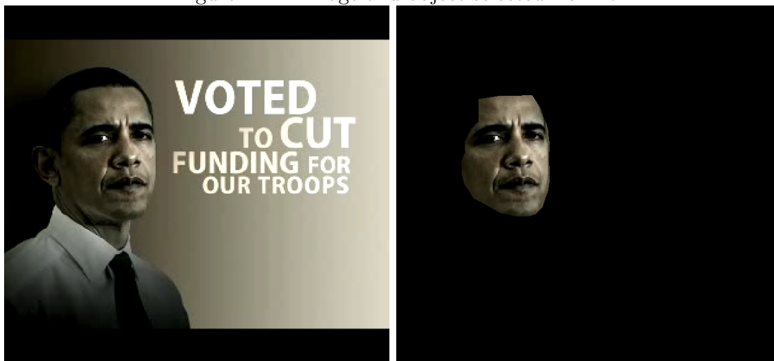
Figure 1: An image and object selected from it

When processing a large batch of images, users may find it more beneficial to go about creating these polygons in a corpus of images by utilizing the interface provided with Bio7 , a Windows and Linux development environment originally designed for ecological modeling, available at http://sourceforge.net/projects/bio7/ . Bio7 provides an excellent interface with which one can outline a polygon in an image and send the image's coordinates to R. With a little bit of scripting, a system can be set up to easily extract the coordinates from an image. For useful scripts and/or advice on setting up a system, please contact the package author [lastname] at stanford dot edu. This was the system used to gather polygons in Messing et al. (2009).