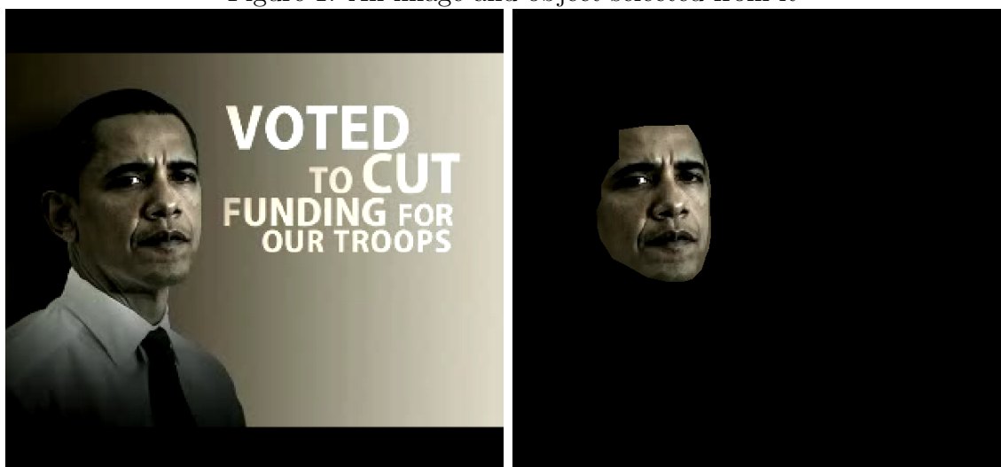
Figure 1: An image and object selected from it

When processing a large batch of images, users may find it more beneficial to go about creating these polygons in a corpus of images by utilizing the interface provided with Bio7 , a Windows and Linux development environment originally designed for ecological modeling, available at http://sourceforge.net/projects/bio7/ . Bio7 provides an excellent interface with which one can outline a polygon in an image and send the image's coordinates to