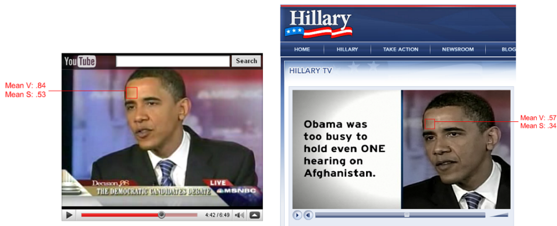
Figure 3: Video still capture from original MSNBC YouTube channel and ad on Clinton campaign website

> data(Campaign2008) > clinton = new("imageMatrix", X = readPNG(system.file("extdata", + "Clinton.png", package = "ImageMetrics")), type = "rgba") png: 505 x 432 [8], 1515 bytes, 0x2, 0, 0 -filter-> 8-bits, 1515 bytes, 0x2 > clintonface = new("imageMatrix", X = ObjSelect(image = clinton@X, + poly = clintonpoly), type = "rgb") > msnbc = new("imageMatrix", X = readPNG(system.file("extdata", + "MSNBC.png", package = "ImageMetrics")), type = "rgba")